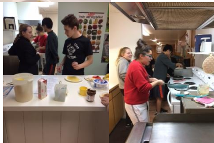
Fun with Foods Elective