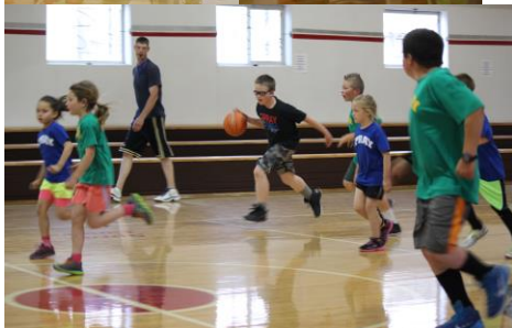
Pee Wee Basketball