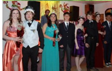
The Prom Court

First Day of School 2016 is Thursday, August 24 th . We will also be having school on Friday, the 25 th .